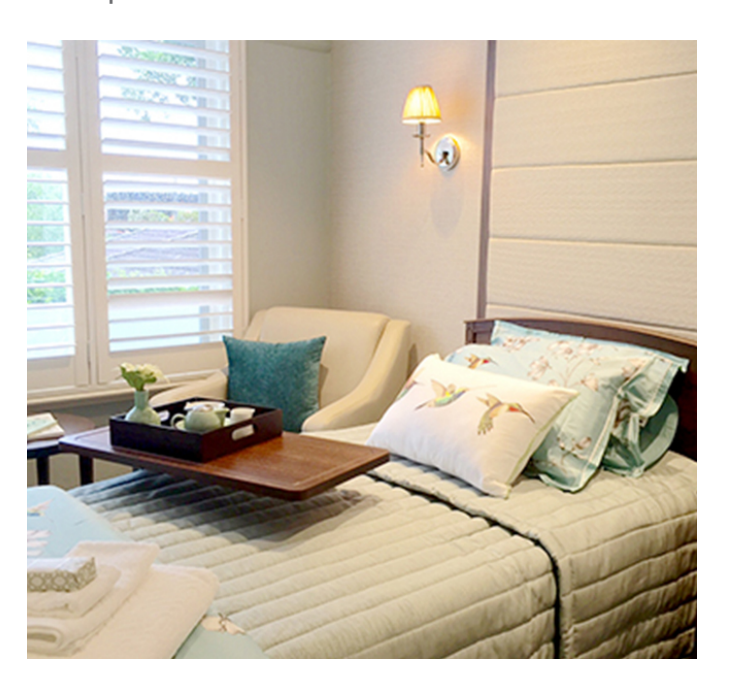
Single Private Room Cost