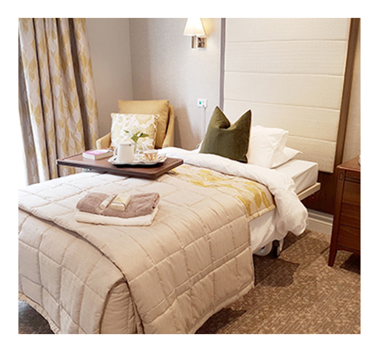
Medium Single Terrace Room Cost $855,000