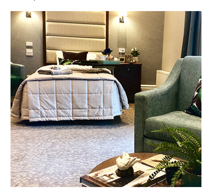
Large Single Terrace Room Cost $1,000,000