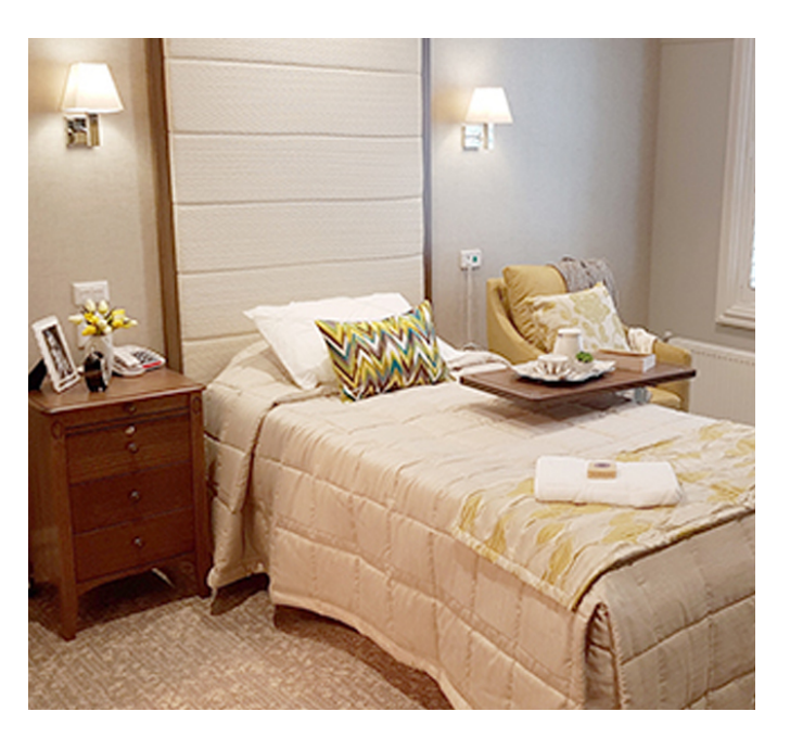
Extra Large Single Room Cost $1,010,000