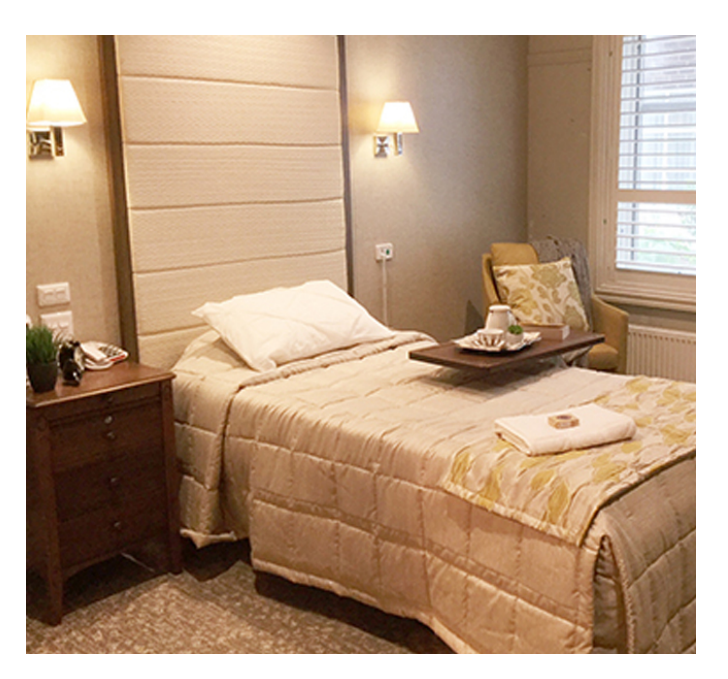
Single Private Room Cost $610,000