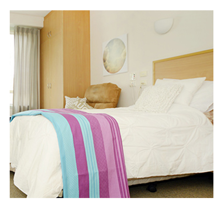
Single Room - Private 3 Room Cost $415,000