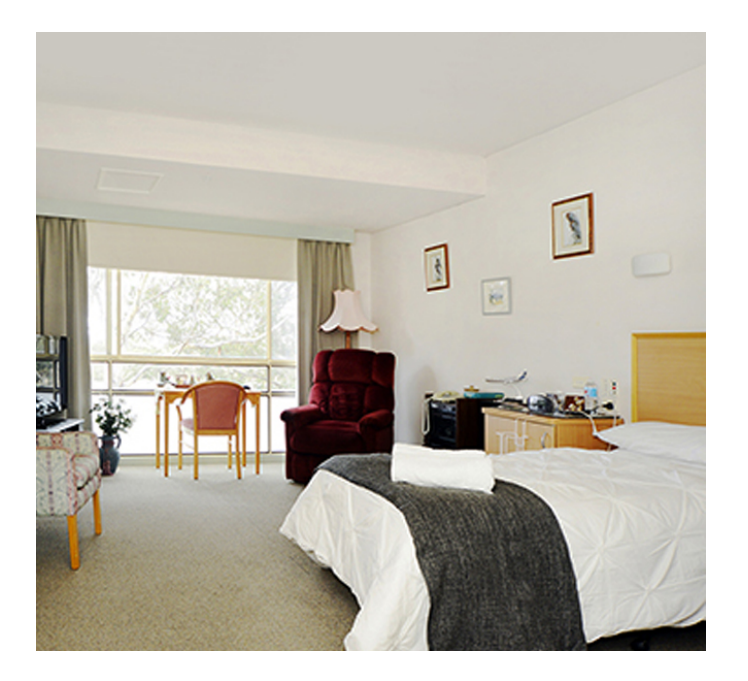
Single Room - Private 2 Room Cost $395,000